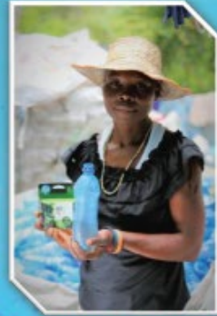
See Rosette's story at hp.com/go/reinventimpact

Some of our suppliers are doing really awesome stuff and we just don't know it.